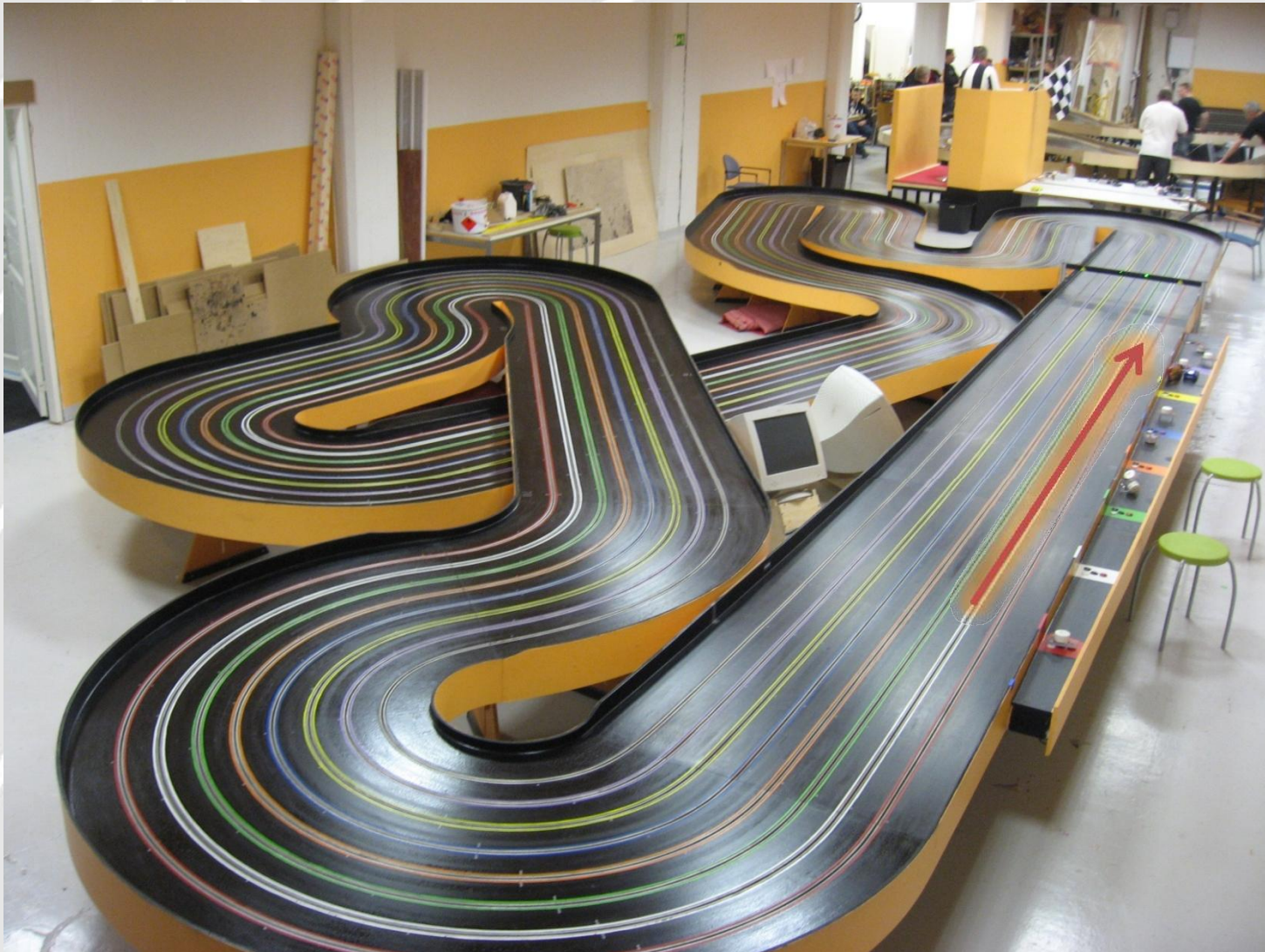
Length 44m, LaneMaster, KemPower IPM6 Direction : Left to right past drivers Positive pole on left